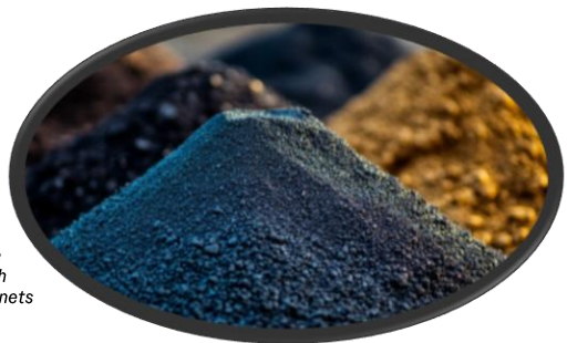
Rare Earth Magnets